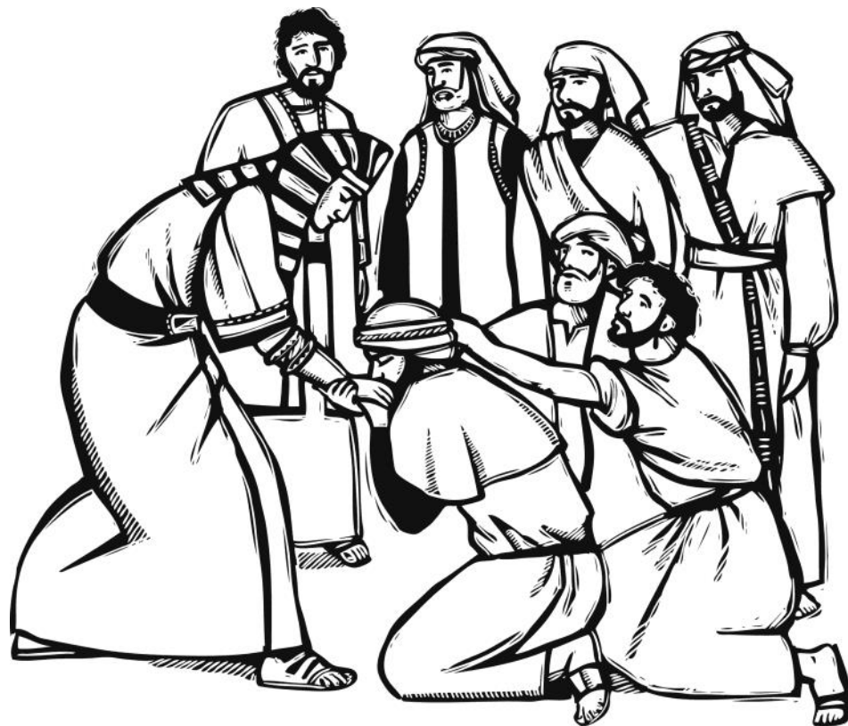
Joseph Forgives His Brothers